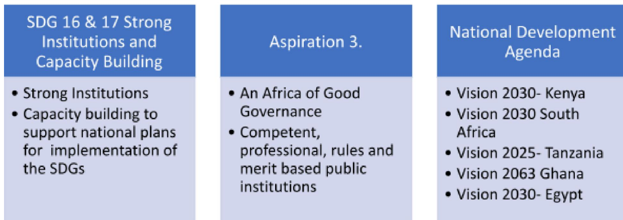
Figure 2: Alignment with SDGs and Agenda 2063

Accordingly, the expected outcomes of the Toolkit - are stated as: