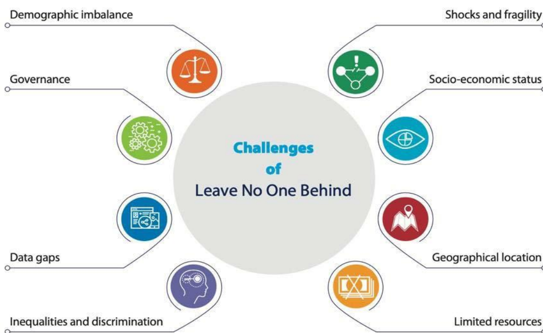
Figure 1 Challenges of Leave No One Behind

The Sustainable Development Goals Center for Africa and Sustainable Development Solutions Network (2020) present several challenges in its Africa SDGs Index and Dashboards Report that are relevant to this toolkit and should be taken into consideration (Figure 1 and pp. 1-3).