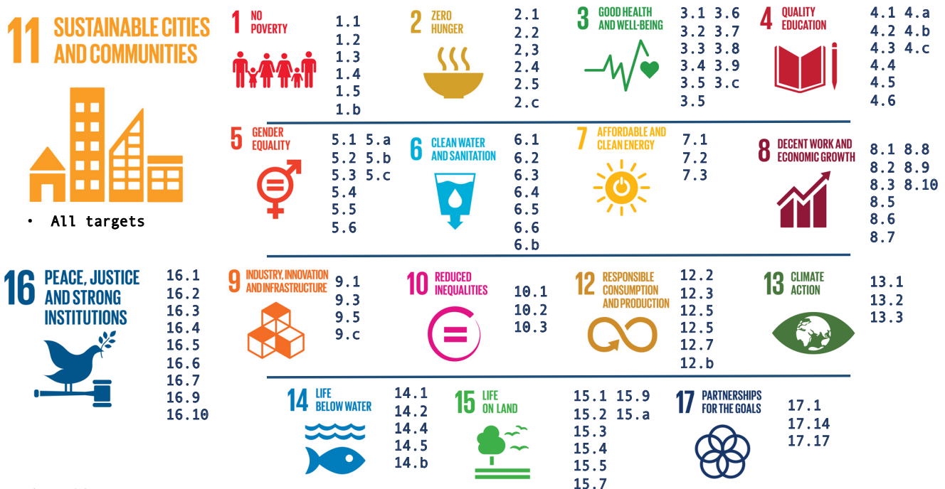
Figure 3.1. SDG Goals and targets that involve sub-national authorities

Successful vertical integration requires coordination of action across different levels of government to jointly formulate and implement sustainable development strategies and